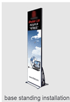
base standing installation